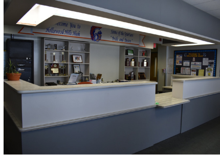
Welcome Center Renovation