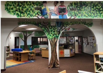
Media Center Improvements