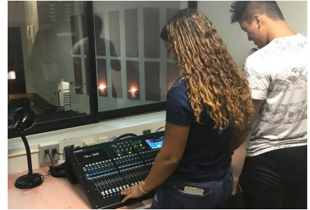
Sound System Upgrades