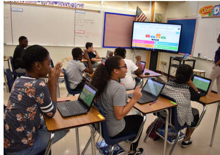
Televisions for Classrooms